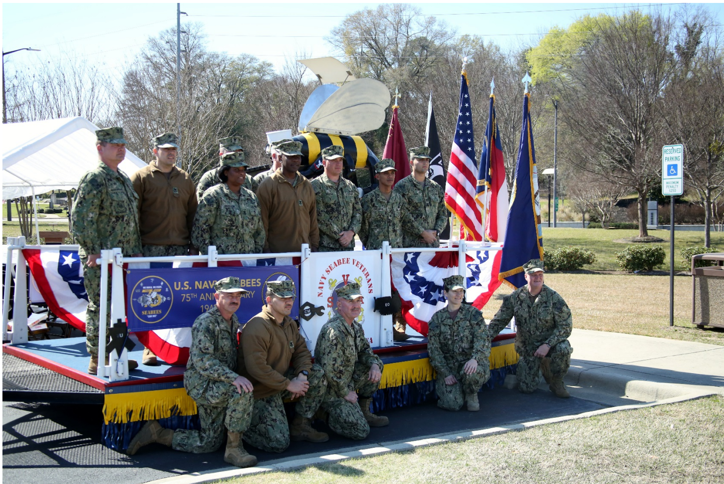
Island X-6 Fayetteville, NC Seabee Float at Dedication of Seabee Monument at Airborne and Special OPS Museum at Fort Bragg, NC.